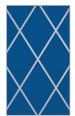
Diamond (flat GBG only)

Custom configurations available upon request.