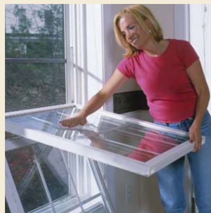
Tilt-in top and bottom sash for easy cleaning.