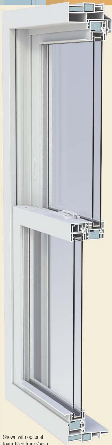
Shown with optional foam-filled frame/sash