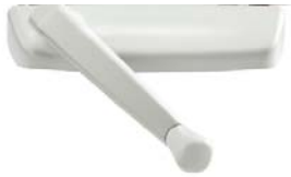
Casement Handle (standard white)